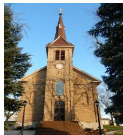
St. John Site

In 1995, St. John the Baptist Parish and Sacred Heart Parish merged to become the parish of St. John-Sacred Heart with each retaining its church site. Our proud heritage dates back to when the first settlers